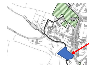
Field adjacent to Wynard House